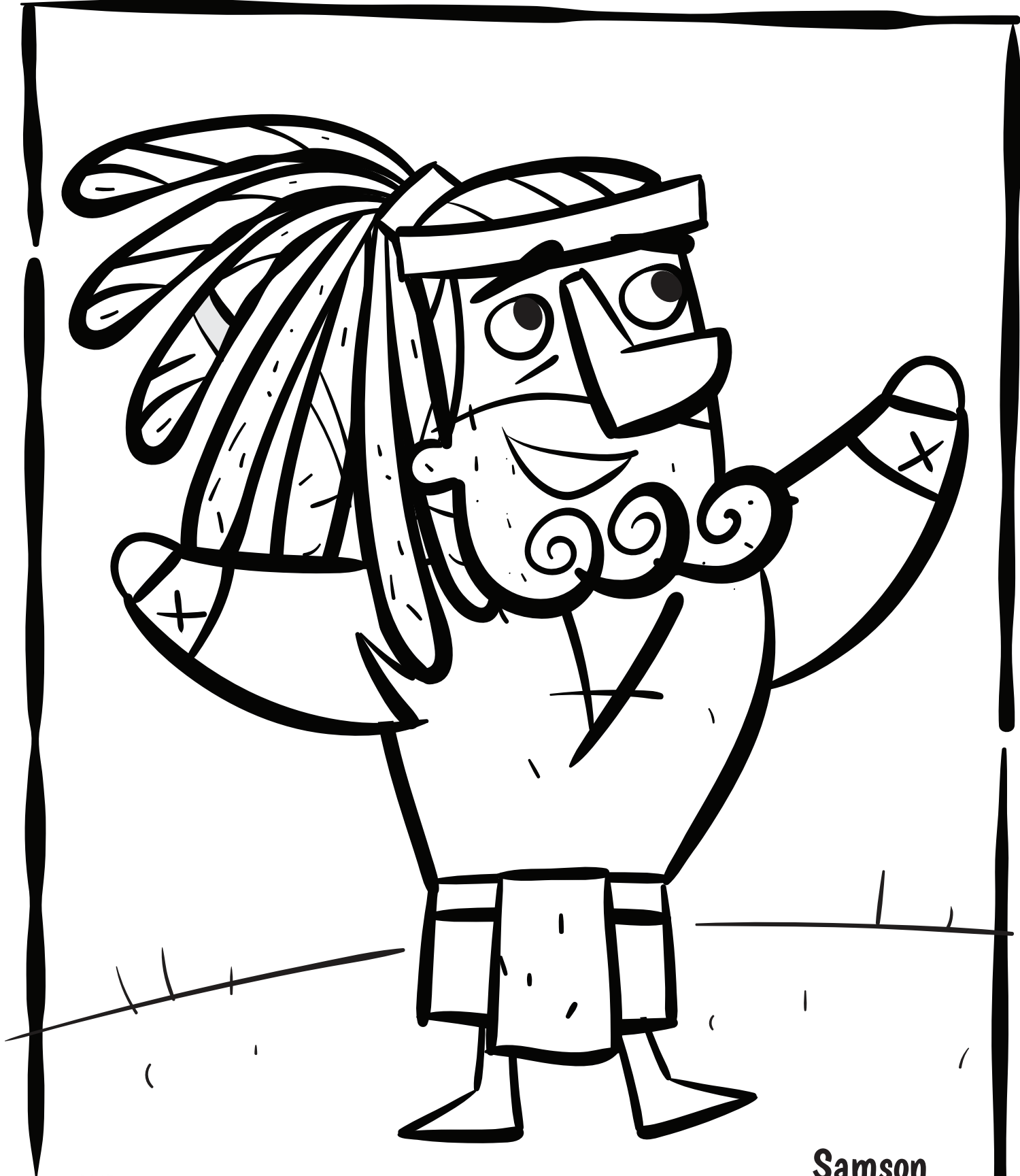
Samson and Delilah